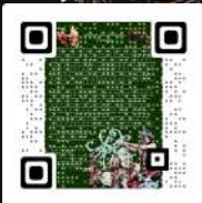
DOHOI OT DANUM DAYAKS