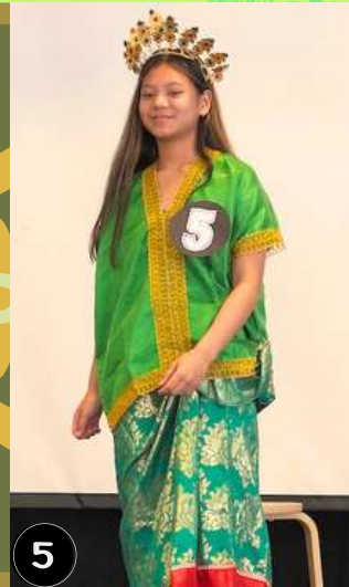
5 Tipwara in clothing from North Sulawesi