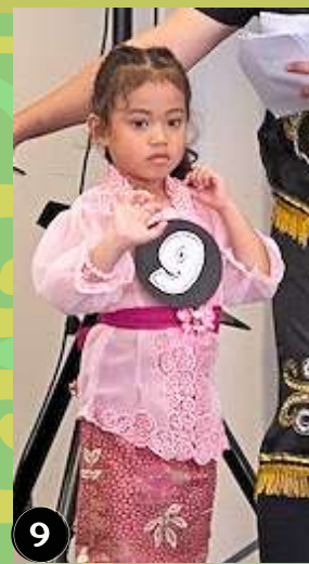
9 This songbird is wearing kebaya from Bali