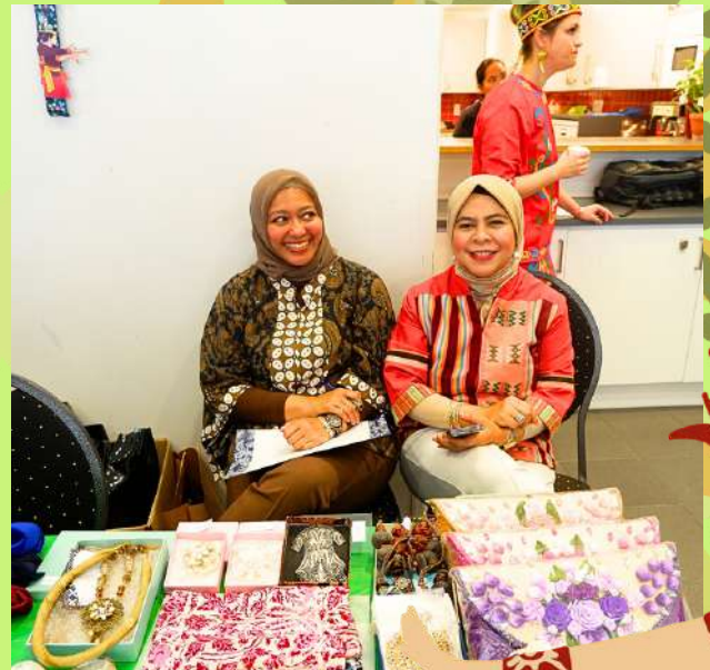
Dharma Wanita (DWP) are selling beautiful handicraft